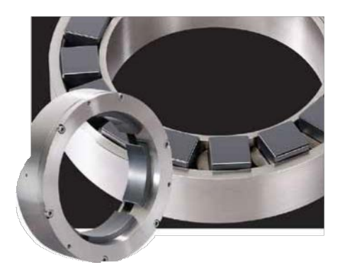
Figure 7 Ceramic bearings.