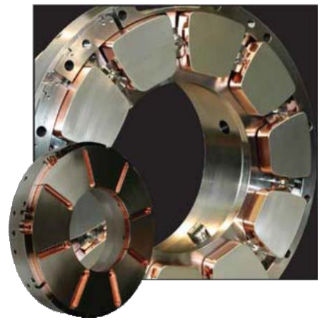
Figure 1 Tilting-pad thrust bearings.